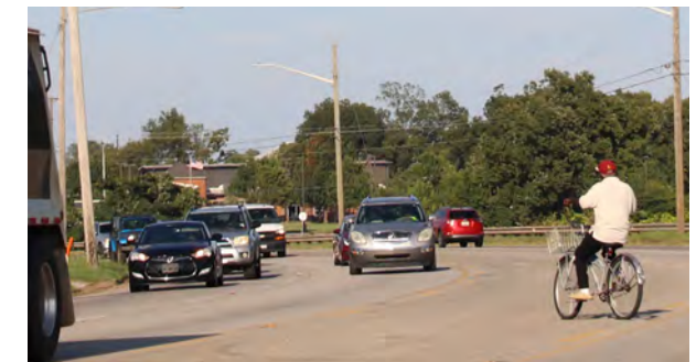
A bicyclist is pictured here crossing Highway 20 to access a convenience store on the north side of the street. All along Decatur's riverfront, Highway 20 poses a threat to cyclist and pedestrian safety.

inaccessible intersections and sidewalks. The project will develop improved signalization, safety measures, paving, and lighting. The separated walking and biking facilities, Universal Design elements, and streetscape improvements combine to offer safer transportation options.