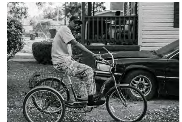
Many Old Town residents rely on walking and biking to access everyday destinations.

Prior to the 1970s and the City's urban renewal efforts, Old Town Decatur was a primarily African American, thriving, walkable, and mixed-use community with family-owned businesses. If asked about that time, Old Town residents reflect fondly and recount the core community destinations like grocery stores, dress shops, barber shops, a fish market, and theaters that once lined Vine Street—the heart of the Old Town. These historic buildings were removed during the Urban Renewal period to make room for new single family residential development. Since that time, some new homes have been erected, but nearly half of the neighborhood remains vacant and has suffered from decades of disinvestment. Today, while still a predominantly Black community, the area has high rates of poverty, a significant number of zero vehicle households, high rates of disabilities, and limited access to jobs, stores, and the riverfront.