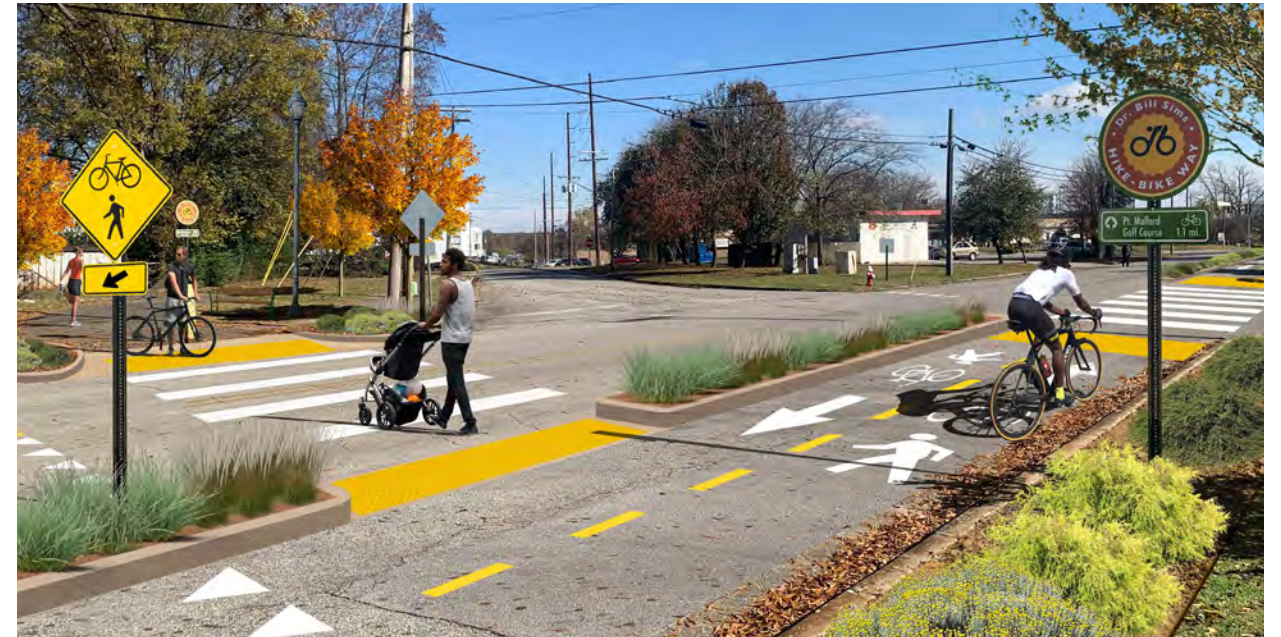
Using space between existing curbs, this improvement to the existing Bill Sims Trail will upgrade bicycle lanes to provide a high-quality, safe, and separated walkway and bikeway.

Benjamin Davis Elementary School Leon Sheffield Magnet Elementary Horizon High School Eastwood Elementary School