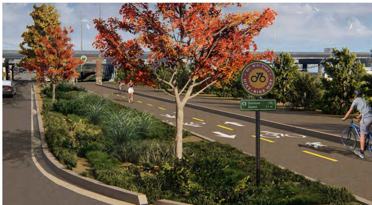
Improvements to the Bill Sims Trail include new landscaped separation from the roadway to increase safety and comfort for those walking, biking, or rolling to riverfront destinations.