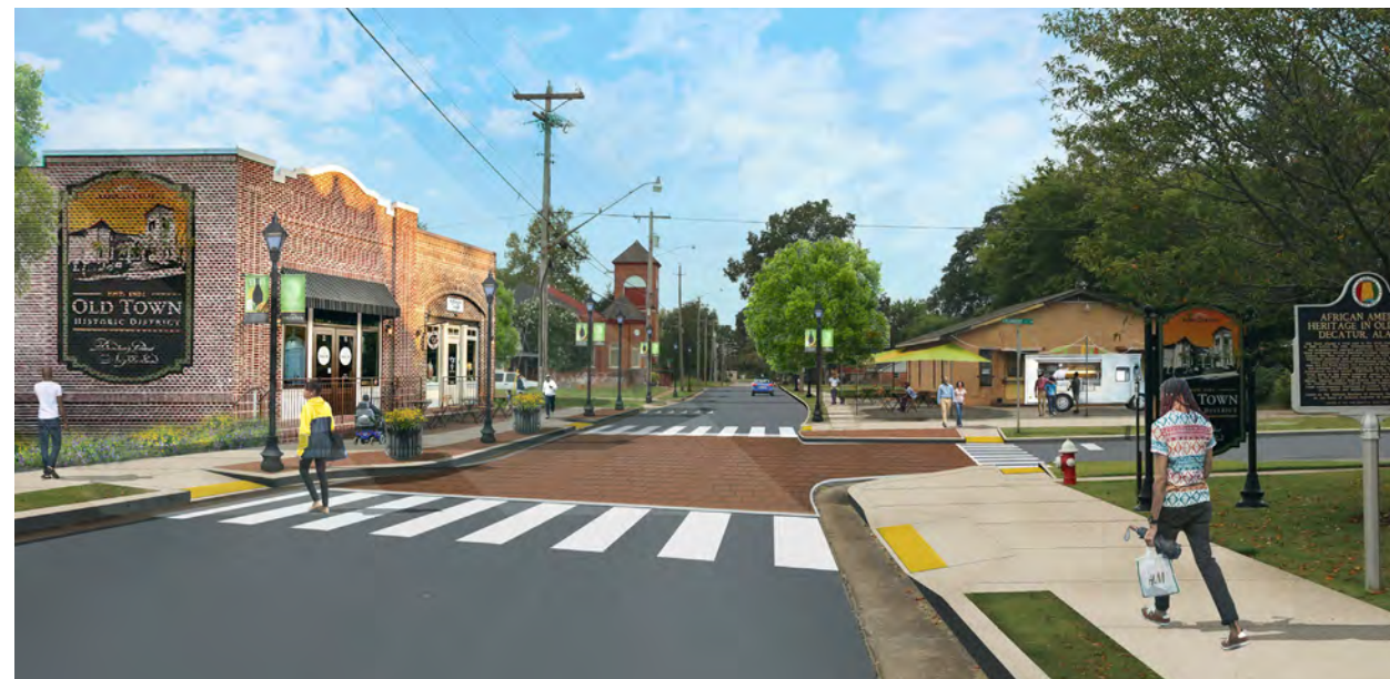
Intersection of Vine Street and Sycamore Street photosimulation of recommended project: The streetscape improvements will create a gateway into Old Town and foster a walkable and thriving community that was once in place along Vine Street. Improved sidewalks, new crosswalks, lighting, and new landscape will create a comfortable environment for residents and visitors.

Project Website https://www.cityofdecatur.com/RCN