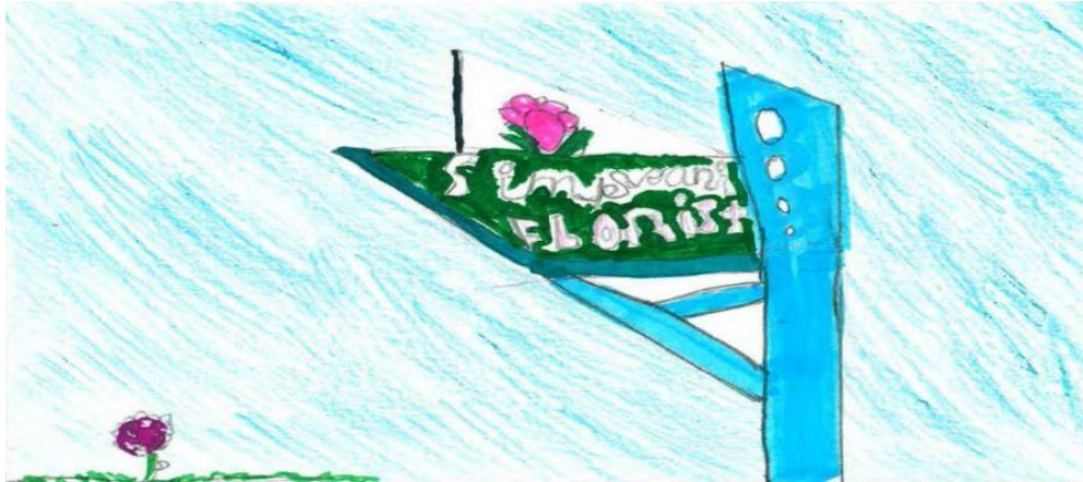
Figure 13: Gavin Martin, Eastwood Elementary, Simpson Design an Ad Contest Entry, Decatur Daily , April 25, 2017