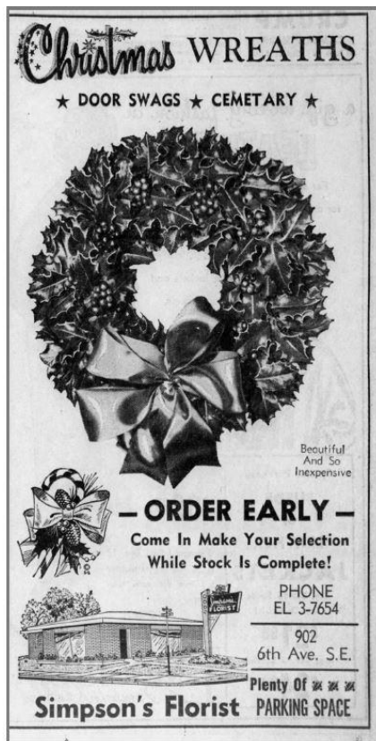
Figure 8: Advertisement, Decatur Daily , December 7, 1958