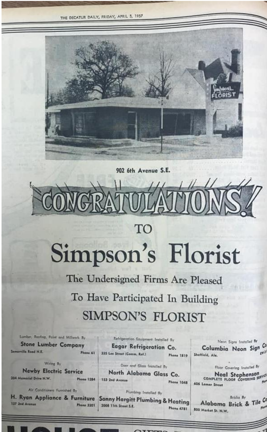
Figure 4: Advertisement for the opening of Simpson's Florist. The Decatur Daily . April 5, 1957