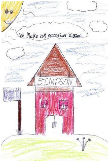
Figure 12: Chloe Peebles of Barkley Bridge Elementary, Simpson Design an Ad Contest Entry, Decatur Daily , April 20, 2015