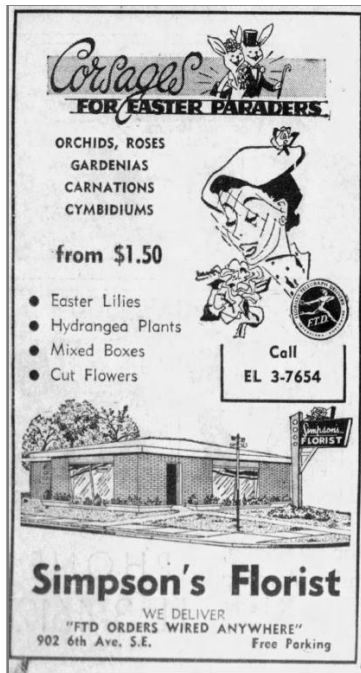
Figure 9: Advertisement, Decatur Daily , March 27, 1959