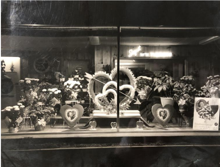
Figure 7: Simpson's Florist display window, February, 1959