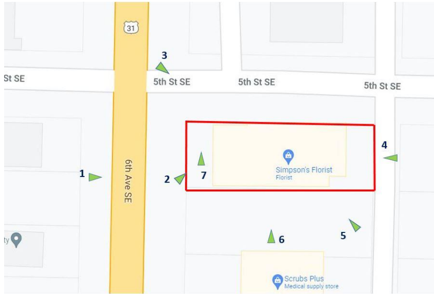
Exterior Photo Key Simpson's Florist 902 6th Avenue SE Decatur, AL