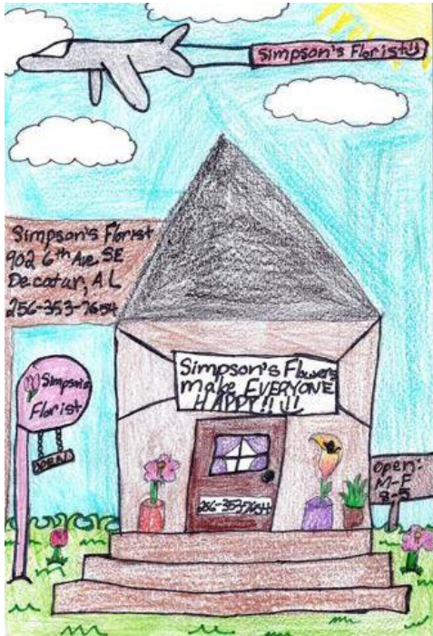
Figure 11: Emily Doshier of Barkley Bridge Elementary, Simpson Design an Ad Contest Entry, Decatur Daily , April 20, 2015