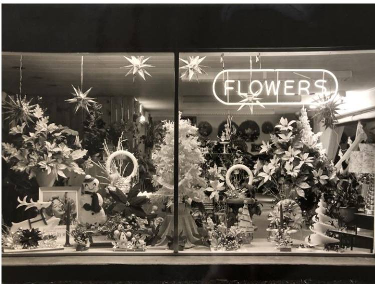
Figure 6: Simpson's Florist display window, December, 1959, family collection